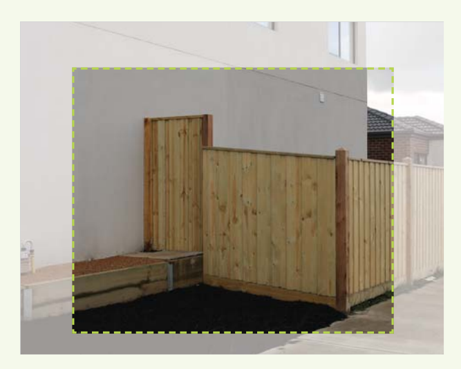
Fig. 12 - Fence design example