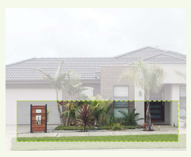
Fig. 14 -Example of no front fence