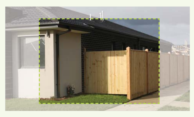
Fig. 11 - Fencing design example