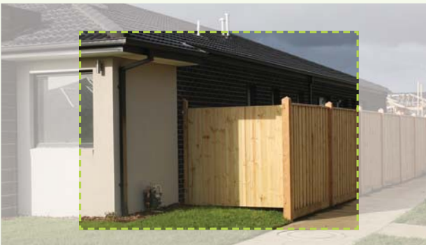
Fig. 11 - Fencing design example