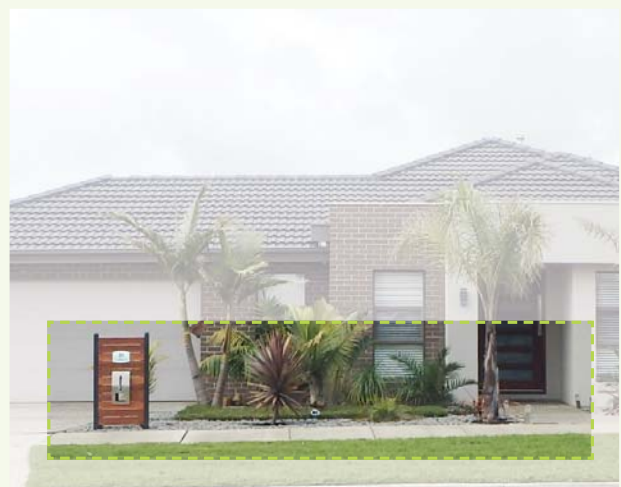
Fig. 14 - Example of no front fence