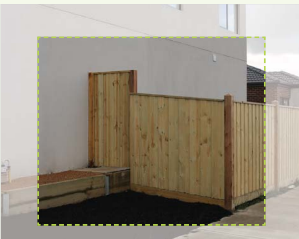
Fig. 12 - Fence design example